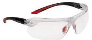
VERSIONS WITH READING AREA : +1.5 : IRIDPSI1,5 +2 : IRIDPSI2 +2.5 : IRIDPSI2,5 +3 : IRIDPSI3