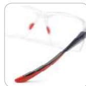
Bi-color & bi-material temples