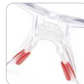
3 positions B FLEX nose