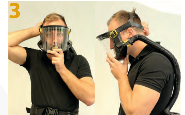
3 Put on mask