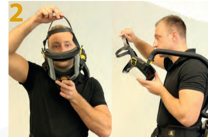
2 Hold mask Hold headband