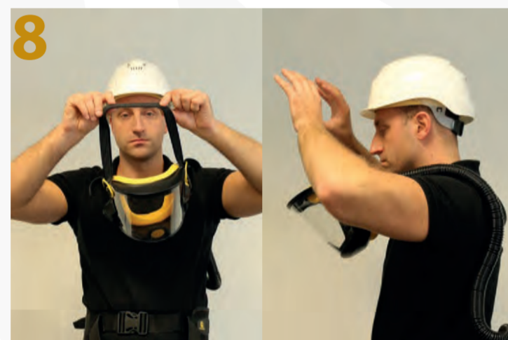
8 Remove mask to the front