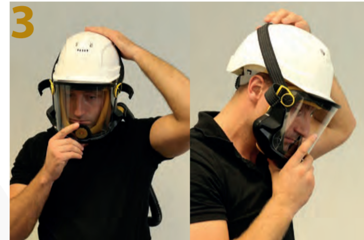
3 Put on mask Fix the headband to the helmet (rubberized side of the helmet) Continue holding the mask