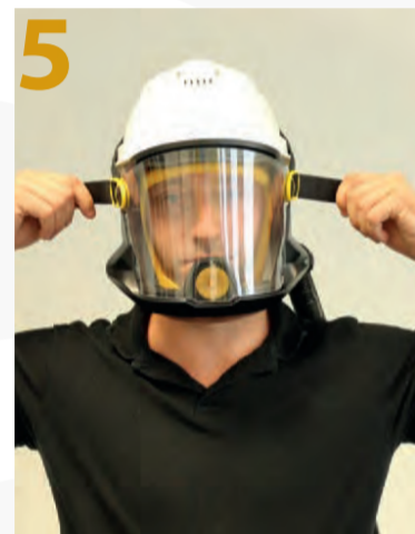
5 Check mask fit Adjust headband