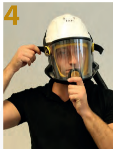
4 Hold the mask Adjust headband left + right