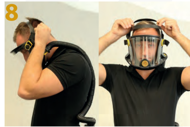
8 Take off headband