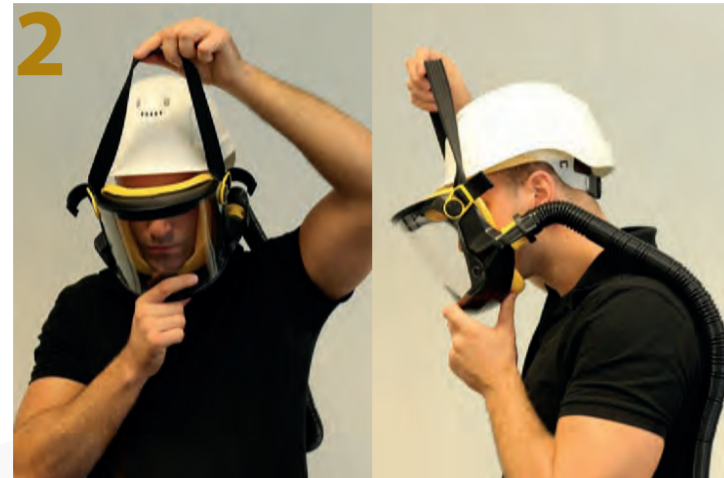
2 Hold mask Hold headband Lead mask to the head