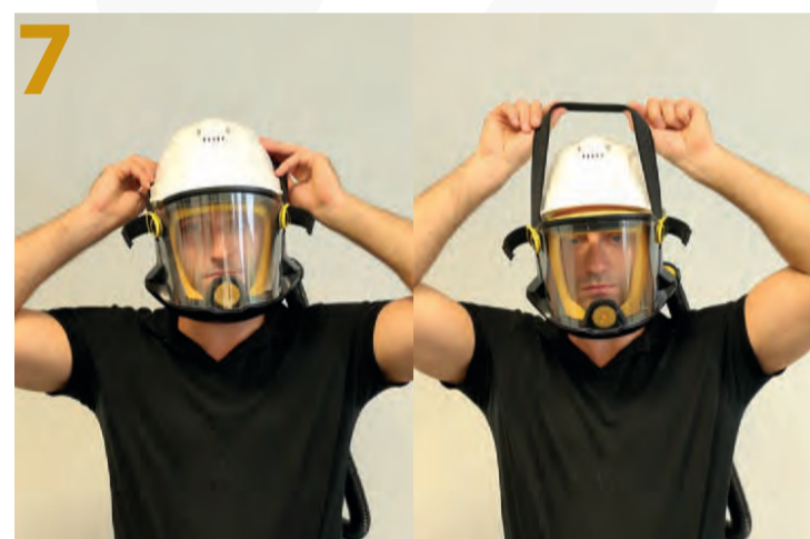
7 Pull off headband to the front