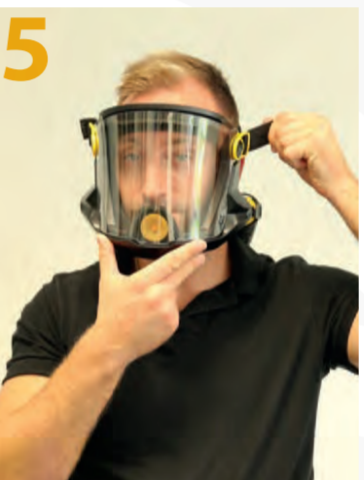
5 Hold mask Adjust headband right