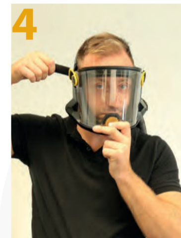
4 Hold mask Adjust headband on left side