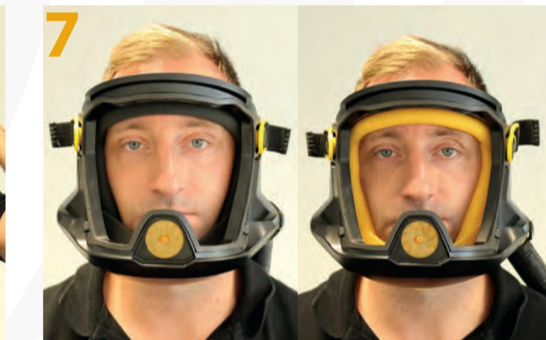
7 Example of a correct mask fit No leakage