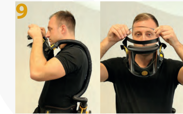
9 Remove mask to the front