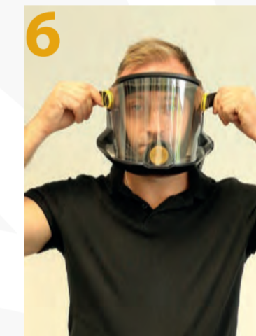
6 Check mask fit Adjust headband