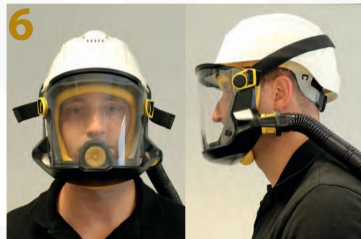
6 Example of a correct mask fit