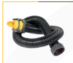
Breathing Hose PU - flexible