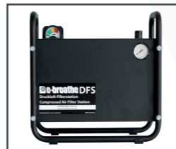
e-breathe DFS CA Filter Station 3