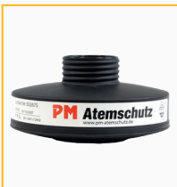
PM Particle filter