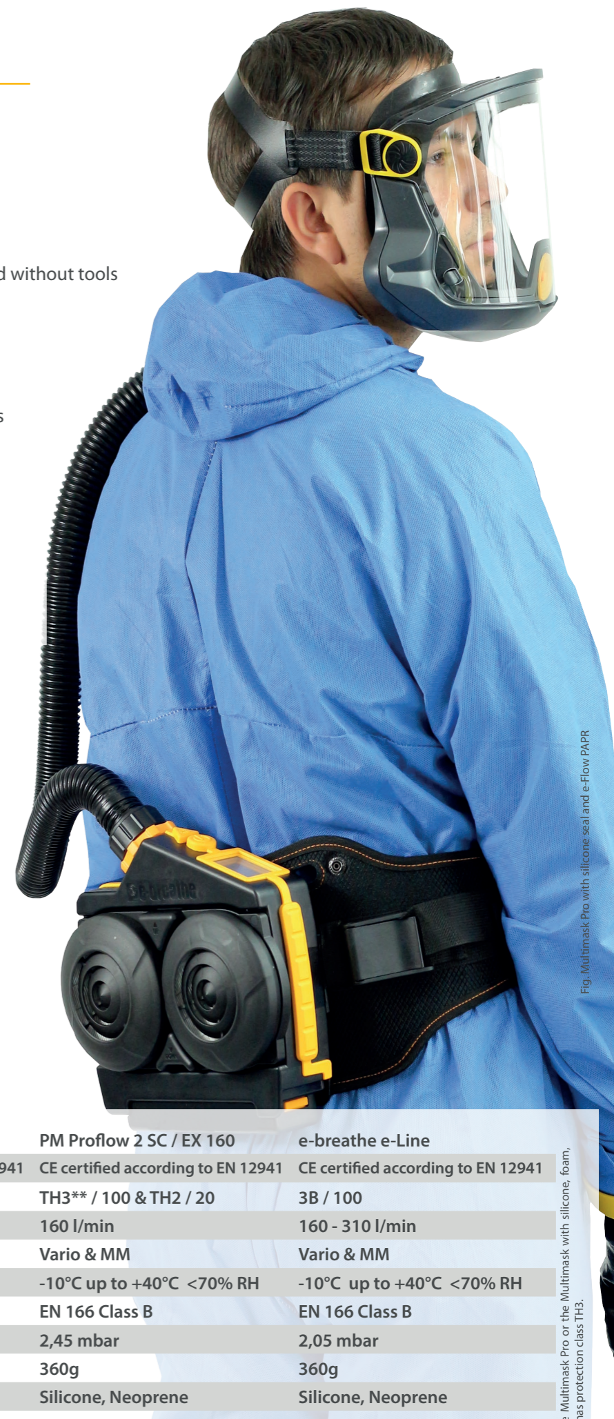
Fig. Multimask Pro with silicone seal and e-Flow PAPR