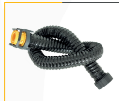
Breathing Hose PU - fixed length