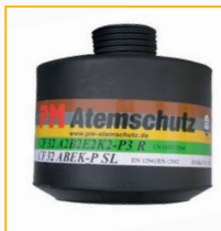
PM Combination filter