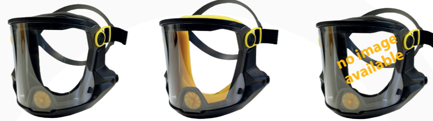
Multimask Pro Click Foam