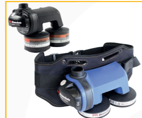
PM Proflow 2 SC/EX 160