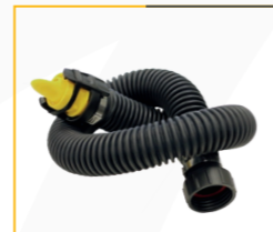
Breathing Hose EPDM - fixed length