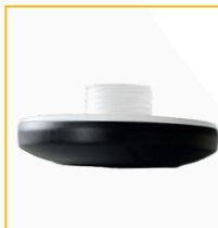
e-breathe Particle filter