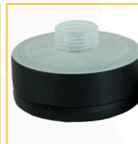
e-breathe Combination filter