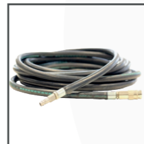
e-breathe DRV CA Hose